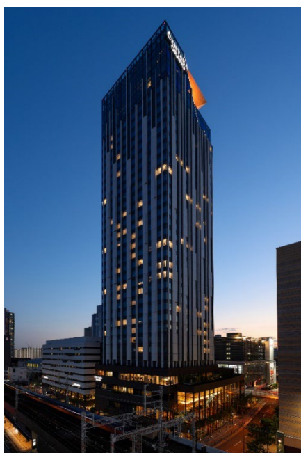
Centara Grand Hotel Osaka Exterior

Hankyu Hanshin Real Estate Investment Advisors ( HHREIA ) here announces the completion of the building, which was developed by a development type hotel fund (hereinafter “ the Fund ”) that HHREIA has been entrusted with its asset management operations, took place on March 31, 2023, together with the opening of “ Centara Grand Hotel Osaka ” (hereinafter “ the Hotel ”), the first hotel in Japan for Centara Hotels & Resorts (999/99 Rama 1 Road, Pathumwan, Bangkok, Thailand, hereinafter “ CHR ”), a well-known Thai hotel chain, opened on July 1 of the same year.